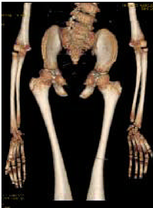
Plate 2 3-D reconstruction CT scan of the pelvic bones: Note (1).The pelvic bones: show coxa vara & there is subluxation of the humeral heads, marked deficient ossification of the ischium with hypoplastic pelvic bones. (2).The hands show various abnormalities, the presence of epiphysis at both ends of the metacarpals & metatarsals. These are cone shaped epiphysis in the phalanges of the hands & feet & multiple pseudo-epiphyses in the metatarsals.

And secondly families of bone dysplasias may be the result of similar pathogenetic mechanisms, however, once the mechanism is discovered in one member of the family, a search for similar mechanisms in others may be rewarding. Hypoplasia of the ischia is an extremely rare congenital malformation, which has been reported as an isolated anomaly in very few cases. It has been known as a syndromic association complex in some congenital malformation syndromes, such as